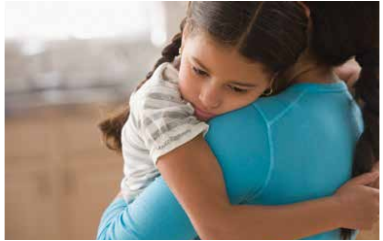
Individuals and families—crisis victims, the elderly and disabled—are helped by the Energy Fund.

With your support, needy area families and individuals will have money to pay for their heat. One hundred percent (100%) of your donation to the Energy Fund goes directly to help people in our area.