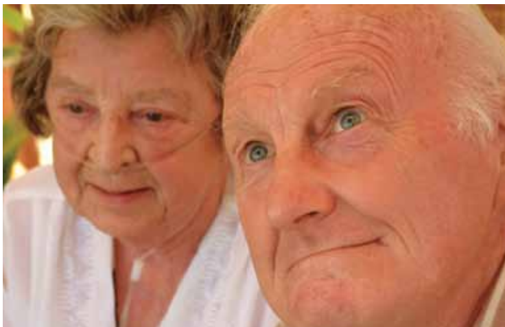
Individuals and families—crisis victims, the elderly and disabled—are helped by the Energy Fund.

With your support, needy area families and individuals will have money to pay for their heat. One hundred percent (100%) of your donation to the Energy Fund goes directly to help people in our area.