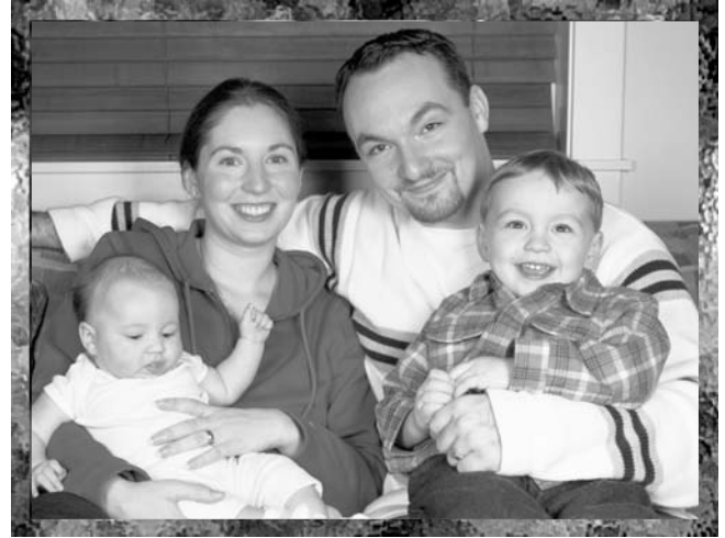
Individuals and families—crisis victims, the elderly and disabled—are helped by the Energy Fund.

With your support, needy area families and individuals will have money to pay for their heat. One hundred percent (100%) of your donation to the Energy Fund goes directly to help people in our area.