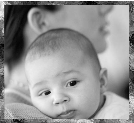
The Energy Fund has helped thousands of area households get through a cold winter.