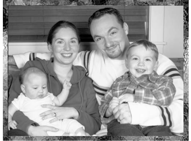
Individuals and families—crisis victims, the elderly and disabled—are helped by the Energy Fund.

With your support, needy area families and individuals will have money to pay for their heat. One hundred percent (100%) of your donation to the Energy Fund goes directly to help people in our area.